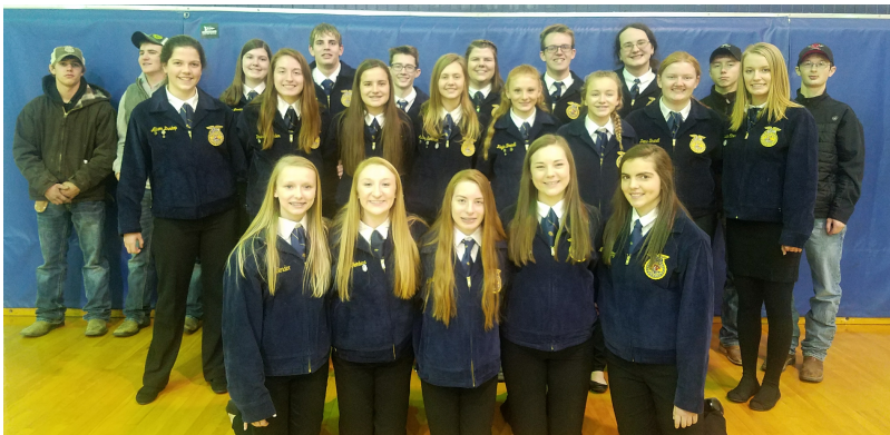
Pictured below: FFA Members that competed in District Leadership Skills Events in Newman Grove, December 4 th , 2017